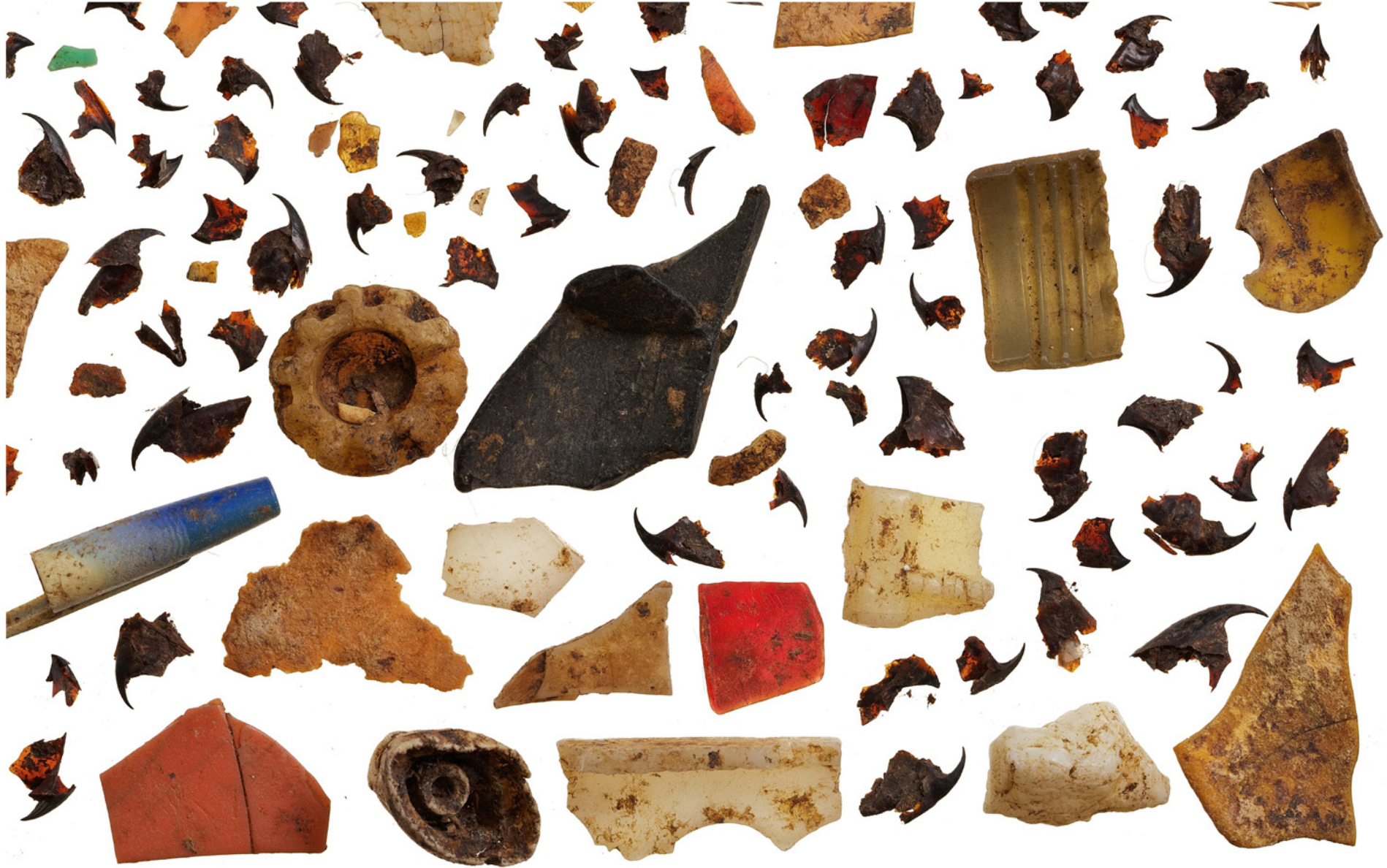
ID 563 No. 25, LAAL-Kure-2008 - bottom right