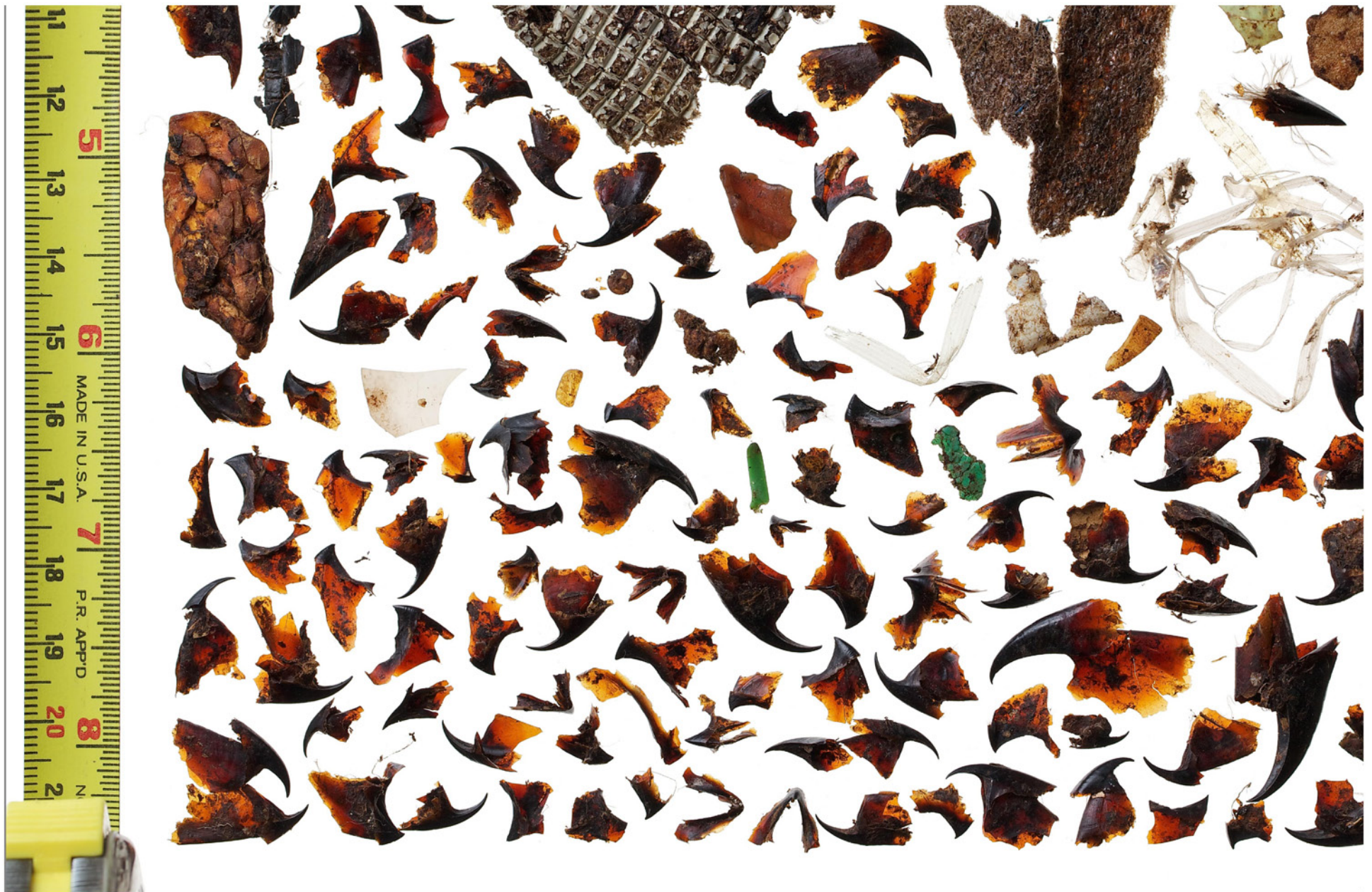
ID 028 No. 28, BFAL-Kure-2008 - bottom left