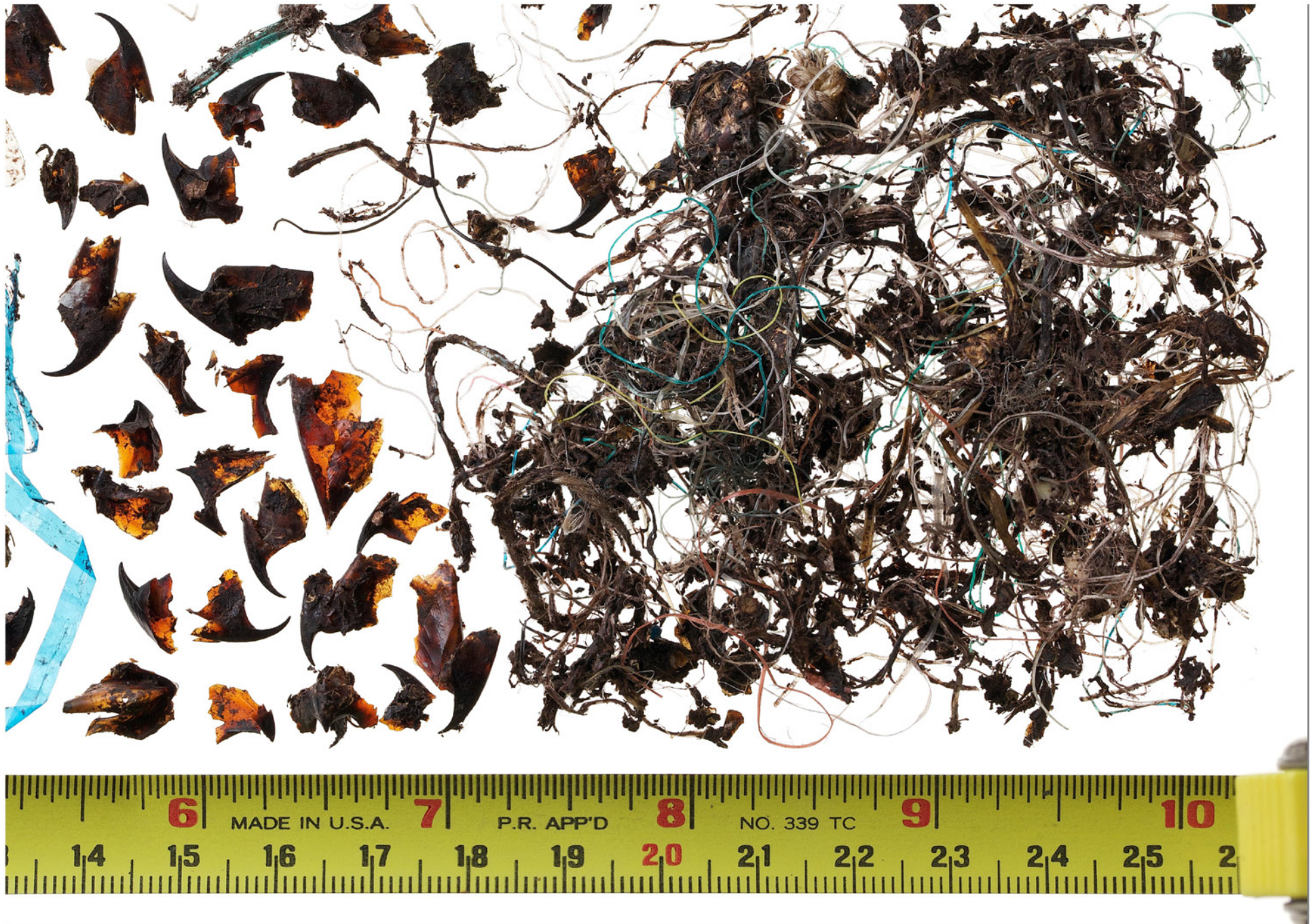
ID 359 No. 22, LAAL-Tern-2009 - bottom right