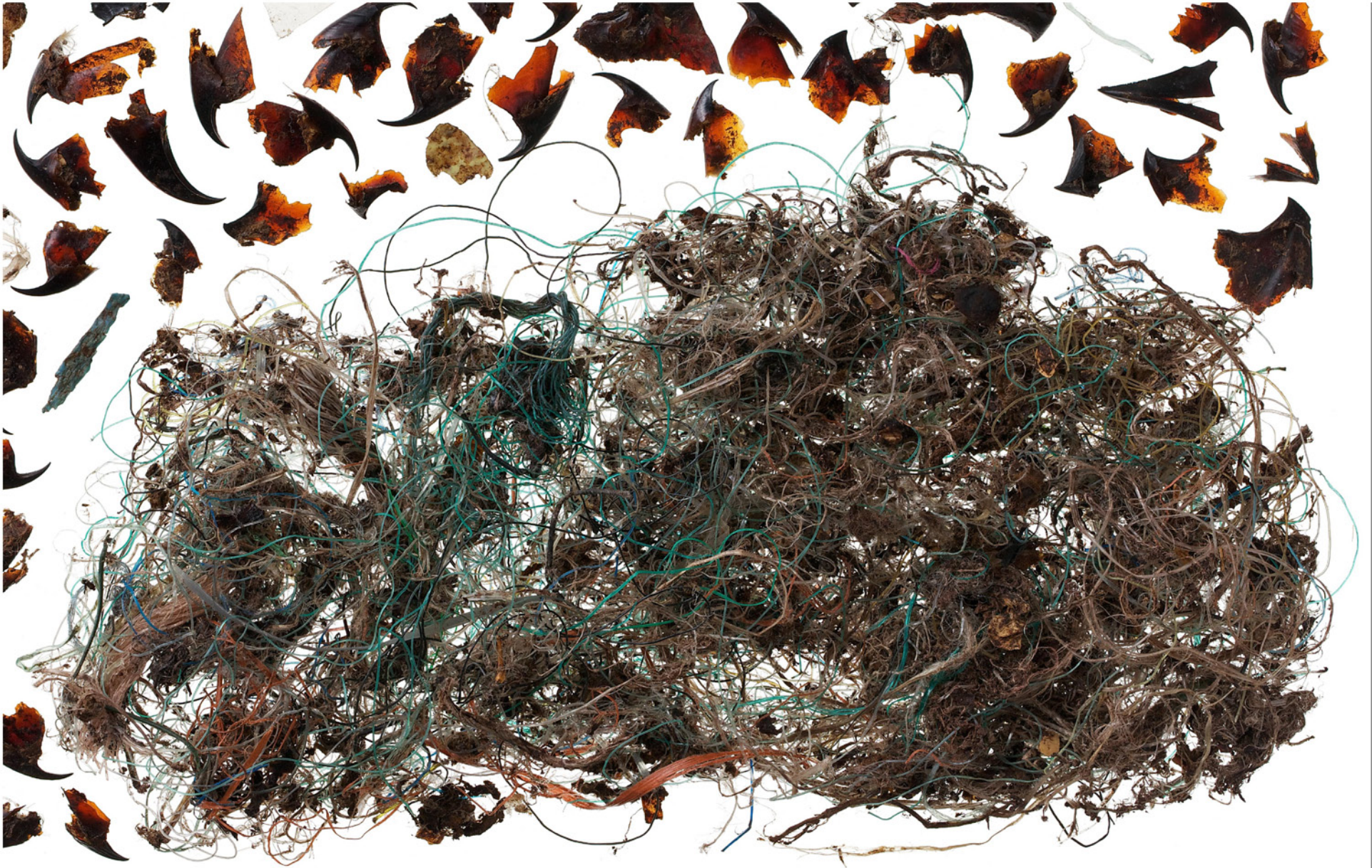
ID 028 No. 28, BFAL-Kure-2008 - bottom right