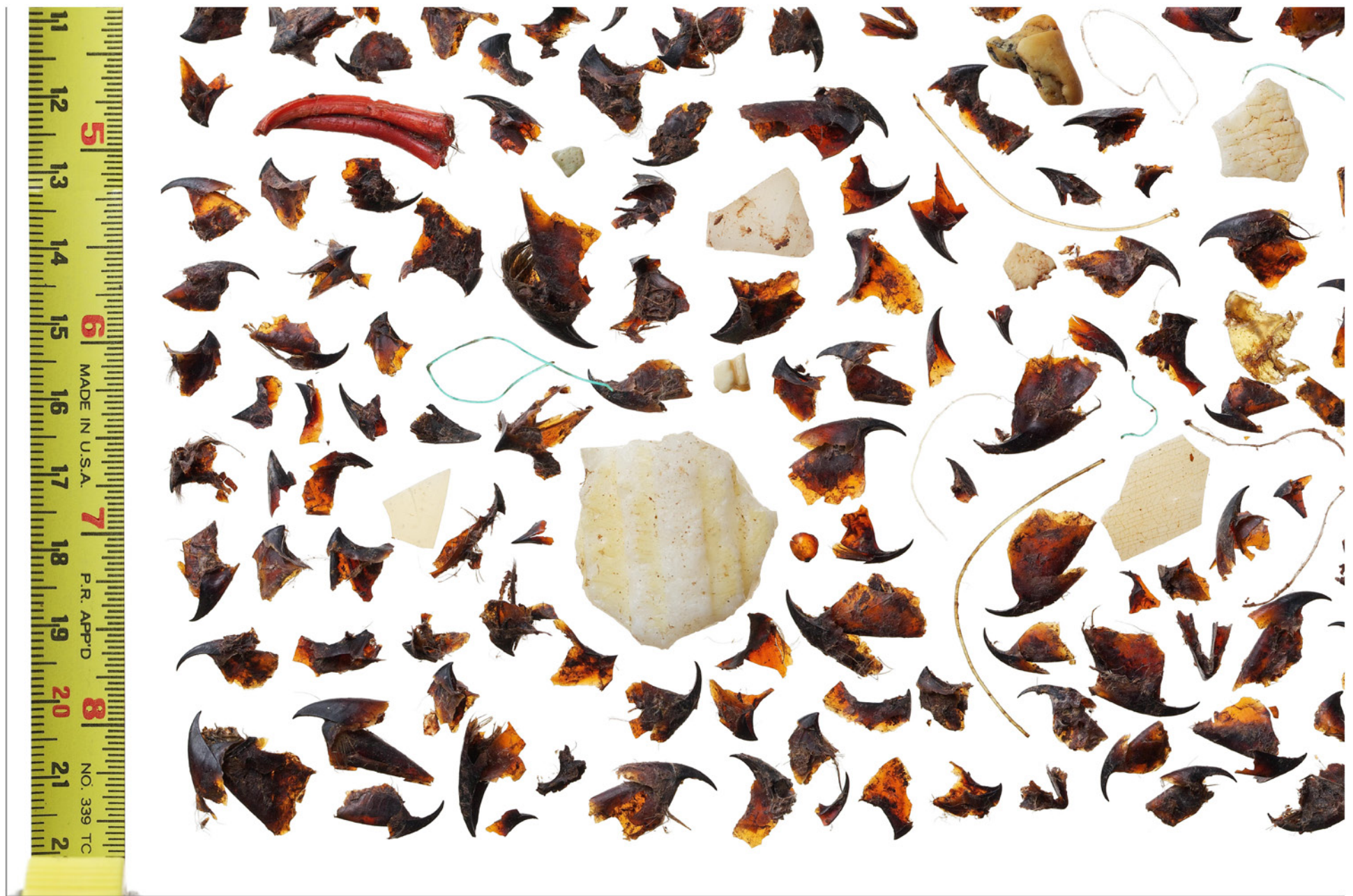
ID 289 No. 16, BFAL-Tern-2009 - bottom left