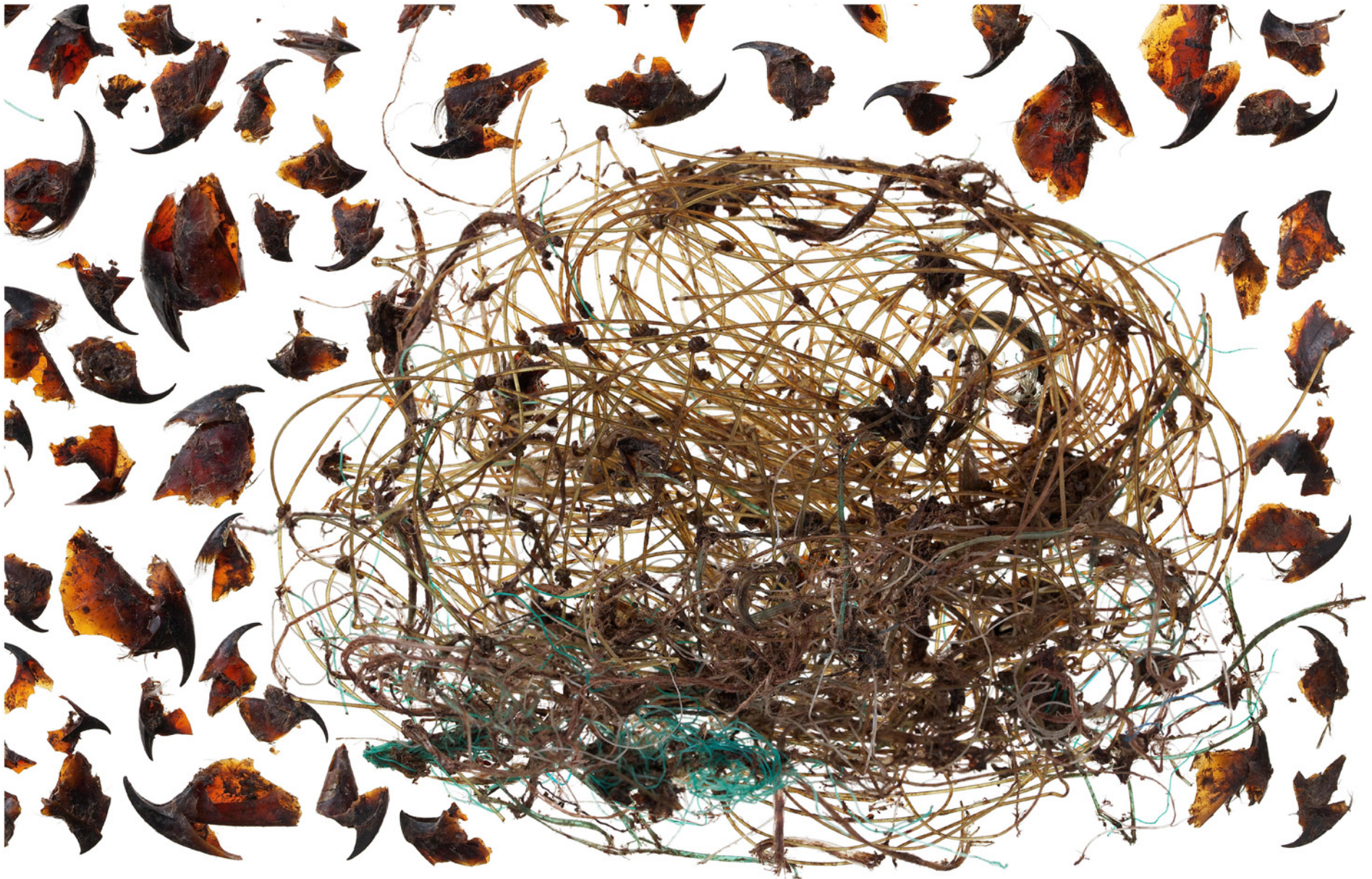
ID 289 No. 16, BFAL-Tern-2009 - bottom right