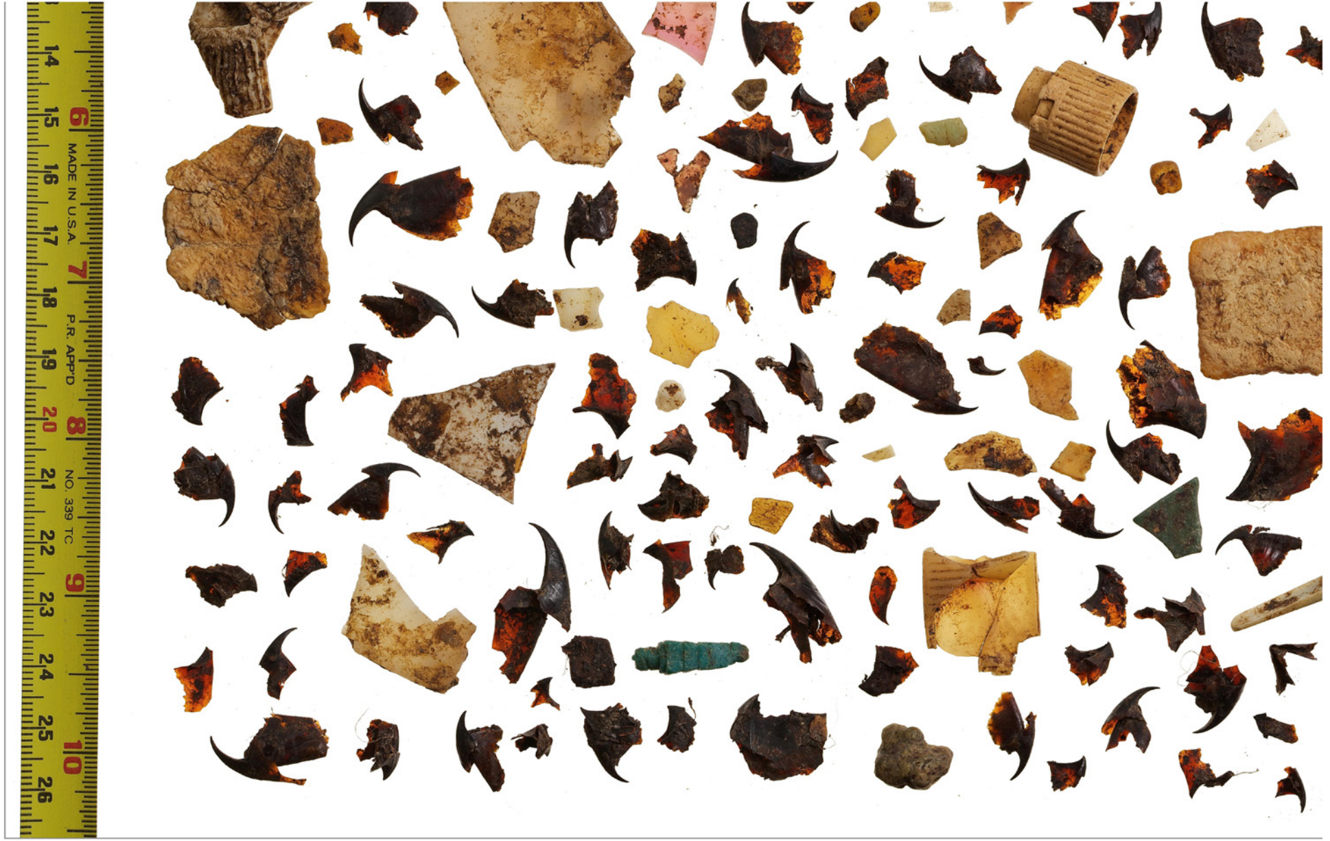
ID 563 No. 25, LAAL-Kure-2008 - bottom left